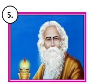
He was the first Asian to win a Noble Prize. He was awarded the literature prize in 1913.