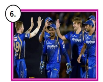
This team won the first IPL held in 2008. It is a franchise cricket team based in Rajasthan, India.