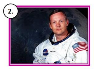
He was an American astronaut and became the first person to step on moon. He descried his first step on Moon as 'That's one small step for man, one giant leap for mankind.'