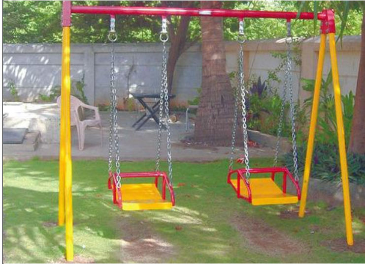
झूला वस्तु का नाम है।