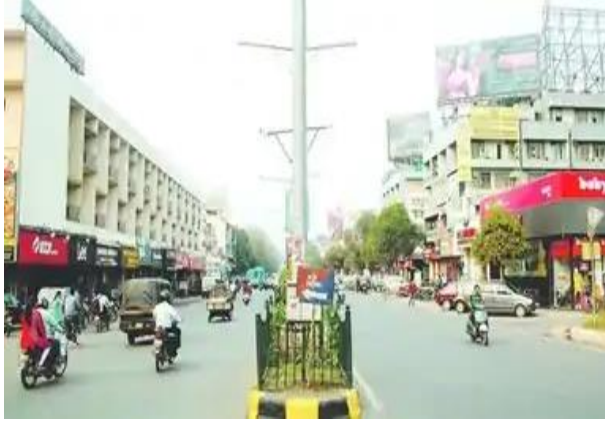
जमशेदपुर शहर का नाम है।