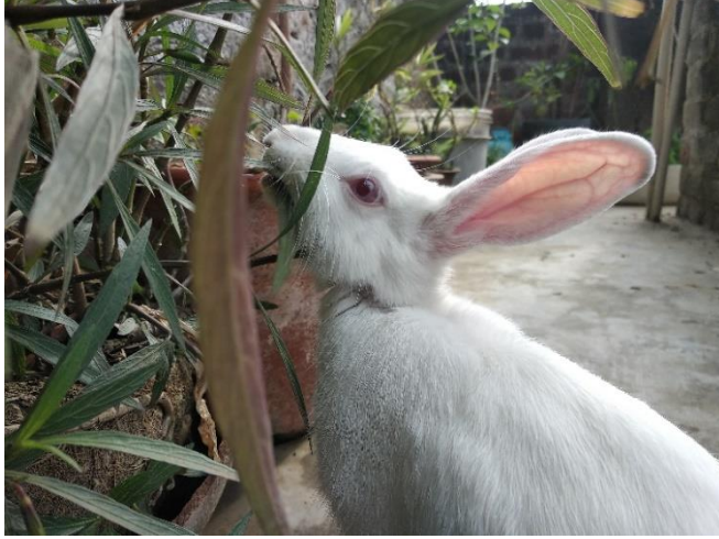
खरगोश प्राणी का नाम है।