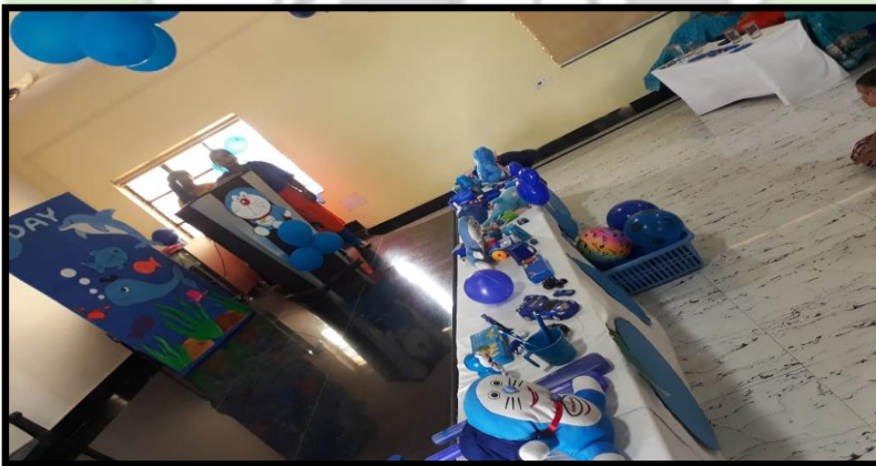
Formatted: Font: Algerian, 22 pt, Font color: Red