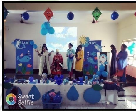
Formatted: Font: Algerian, 22 pt, Font color: Red