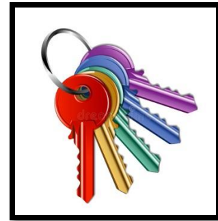
चाबियों का- गुच्छा