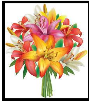
फूलों का- गुलदस्ता

हिन्दी भाषा में अलग-अलग वस्तुओं के समूह के लिए जिन शब्दों का प्रयोग किया जाता है, उन्हें समूहवाची शब्द कहते हैं। जैसे-